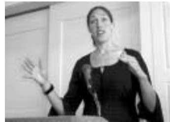
Rebecca Lobo was as much a commanding presence at the conference as she was as a UConn basketball star.