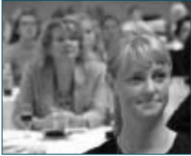
Attendees at the women's networking session applauded the statements and experiences of the speakers.

From the June 22, 2004 issue of E-MainStream